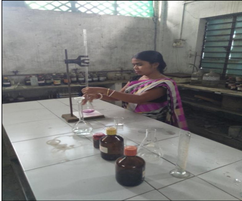
Figure 2: Analysis of water samples