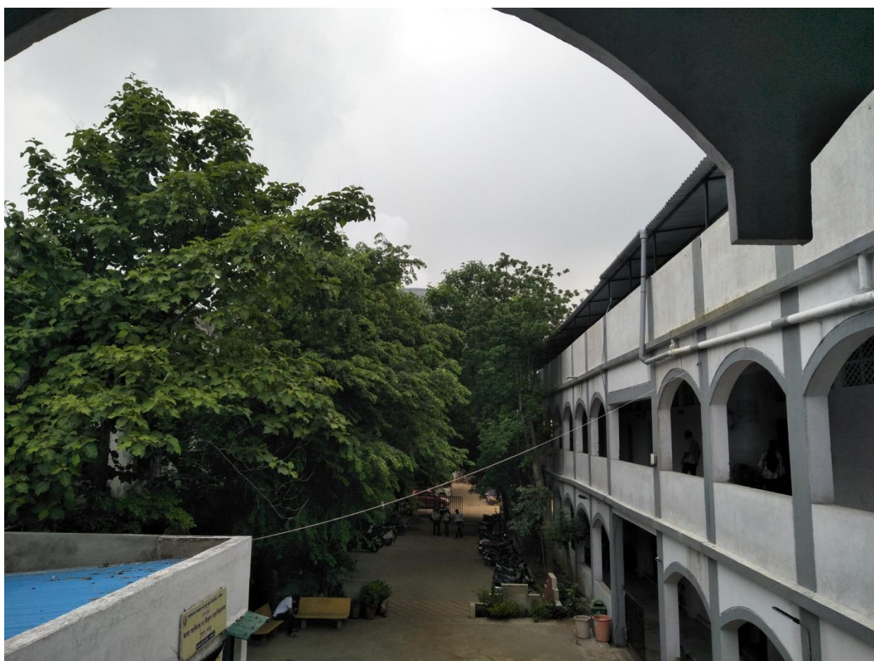
Figure 1: A green view of college campus