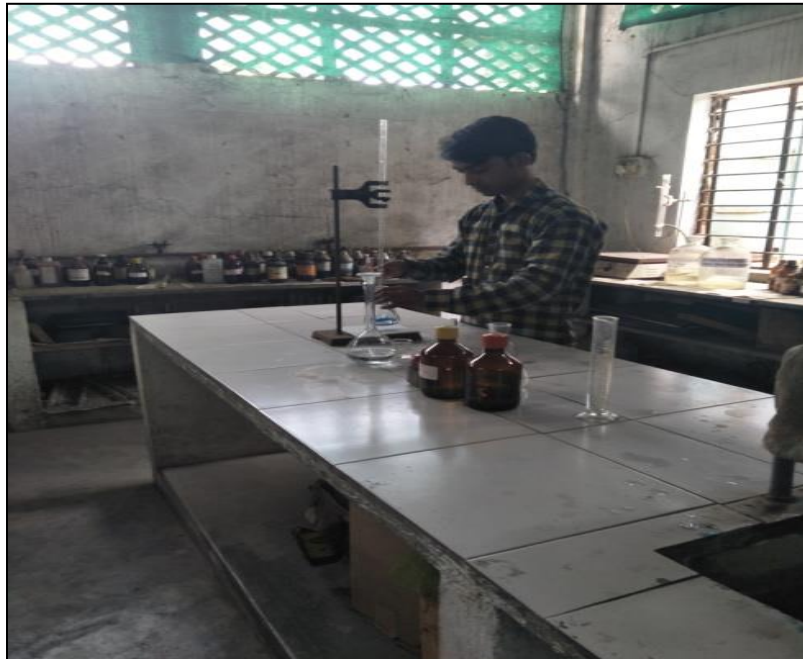
Figure 3: Analysis of water samples